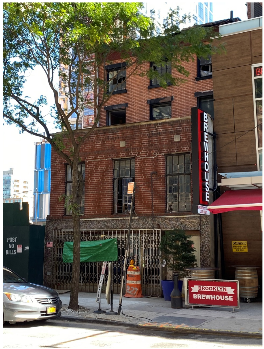
2019 Photograph, LPC

Built: c. 1847-1850Architect: UndeterminedStyle: Greek RevivalProposed Action: Propose for Calendar June 30, 2020